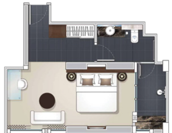
PREMIERE CORNER ROOM 40 Sqm.