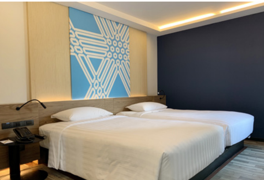
DELUXE ROOM 32 Sqm.