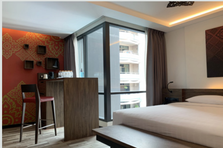
GRAND ROOM 32 Sqm.